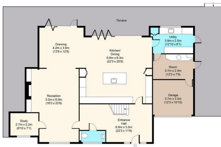
First Floor Approx. 125 Sq. meters (1346 Sq. feet)